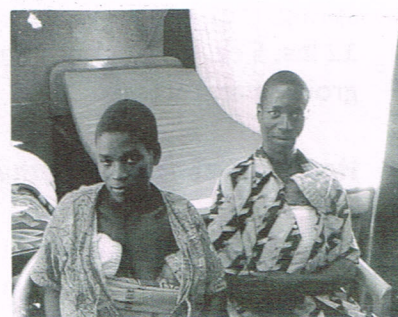
How do you do KMC with triplets? Like this!

P.S. KMC nurseries also operate at other MBF-supported hospitals in Malawi. We are blessed to partner with hospitals in Nkhoma, Ekwendeni and Mulanje. Thank you for extending our reach throughout MBF's hospital network to save more babies.