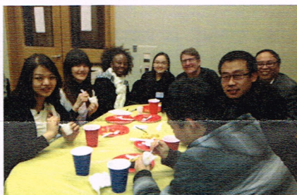
Monthly First Friday Fellowship at UT