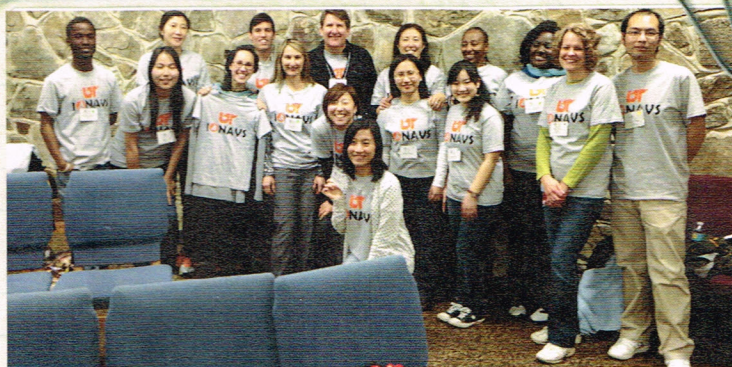
Students from University of Tennessee at the Int'l Student Conference in Talladega, Alabama

Recently one Phd student said, "Coming from a different religious background, there was a time I was not interested. Then the Bible class really helped me understand and now I truly believe in God."